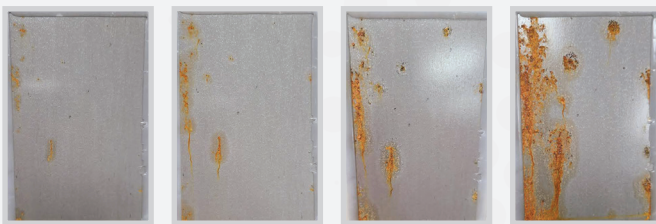
Hot-Rolled Steel (P&O) • FeGuard • (0.4 mils)