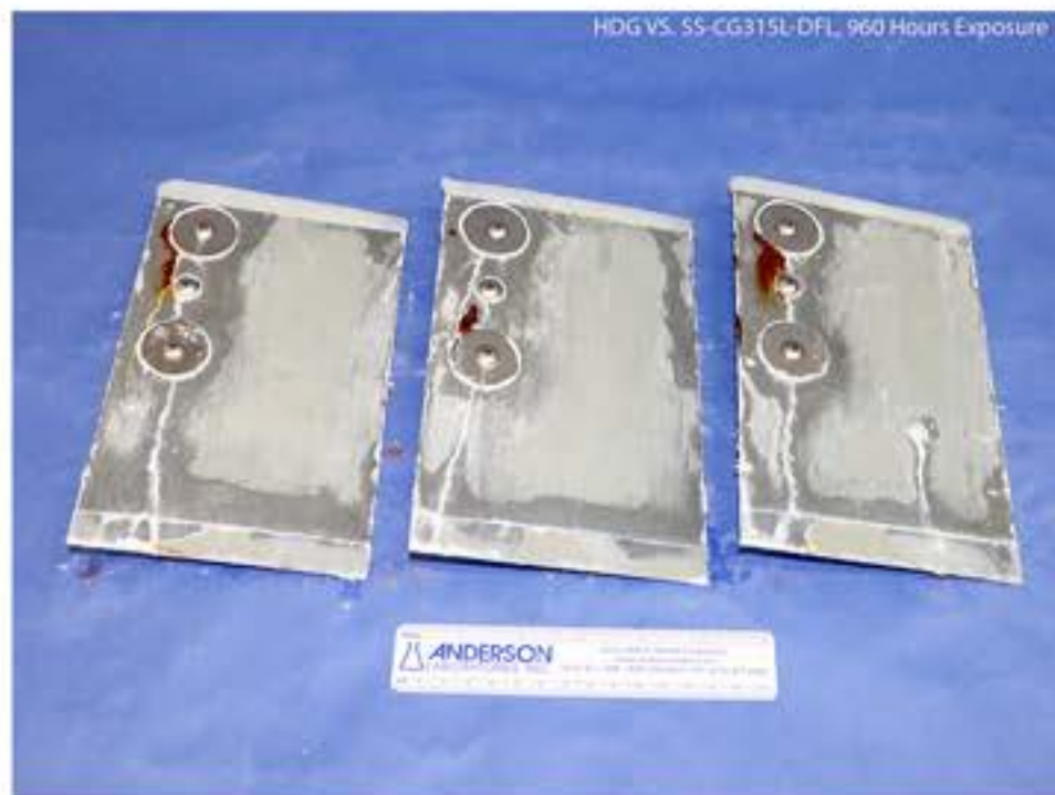
InterCoat ChemGuard 315-DFL