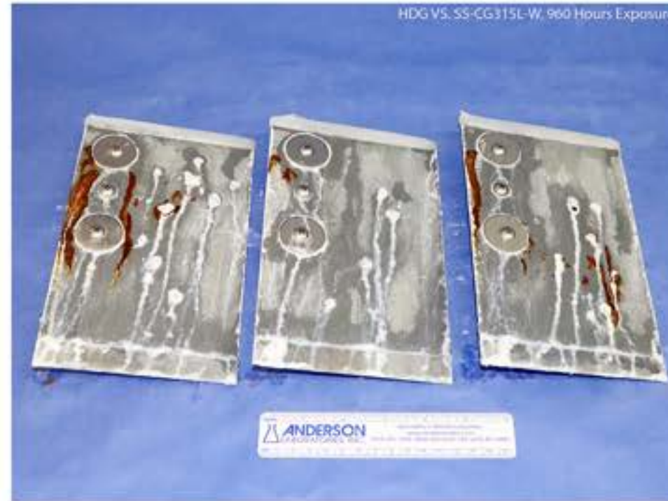
InterCoat ChemGuard 315L-W