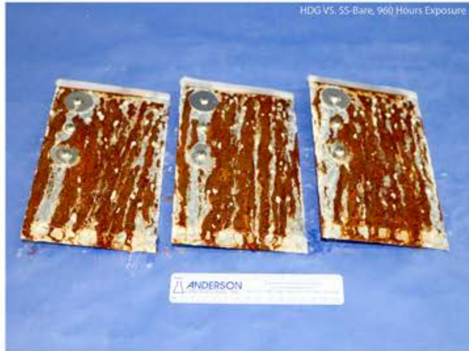
Bare Galvanized No Coating