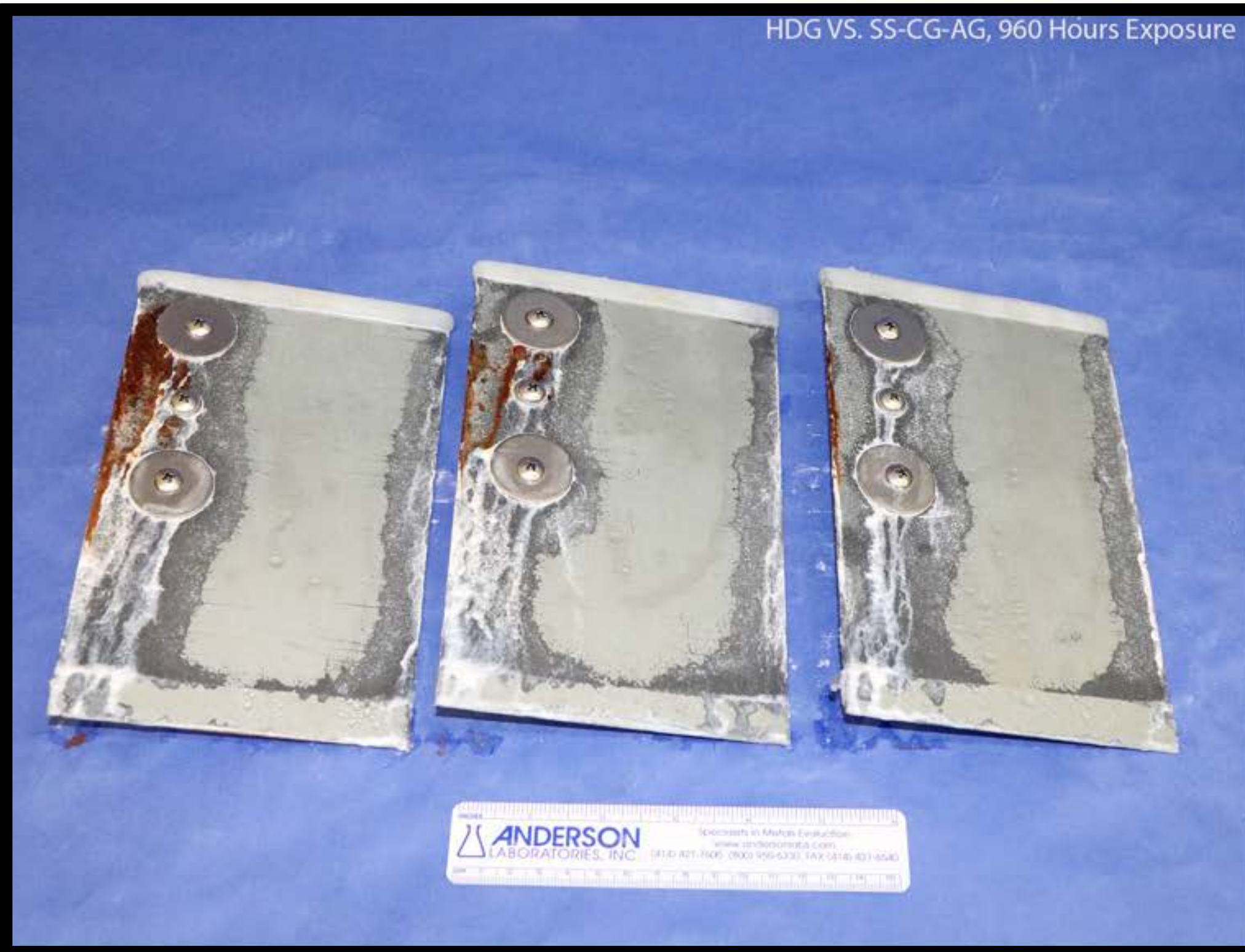
HDG VS. SS-CG-AG, 960 Hours Exposure