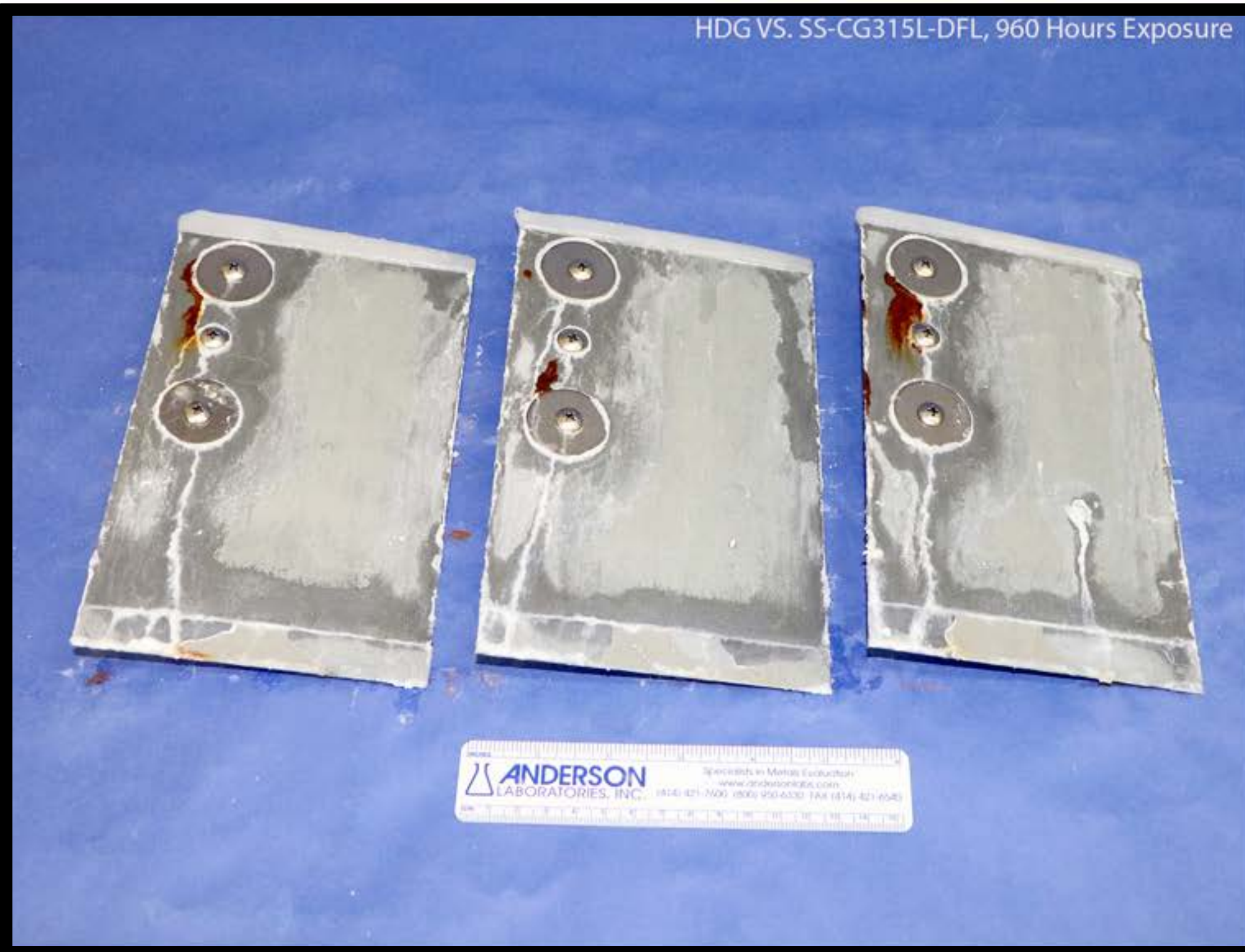
HDG VS. SS-CG315L-DFL, 960 Hours Exposure