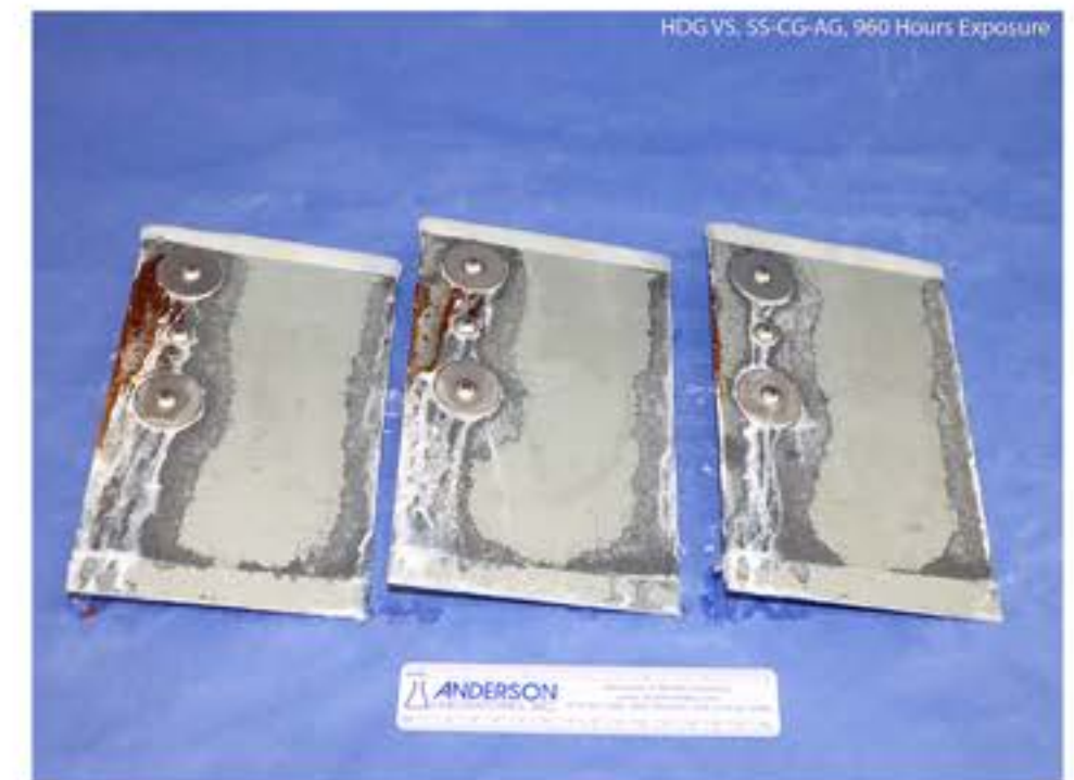
InterCoat ChemGuard 315-AG