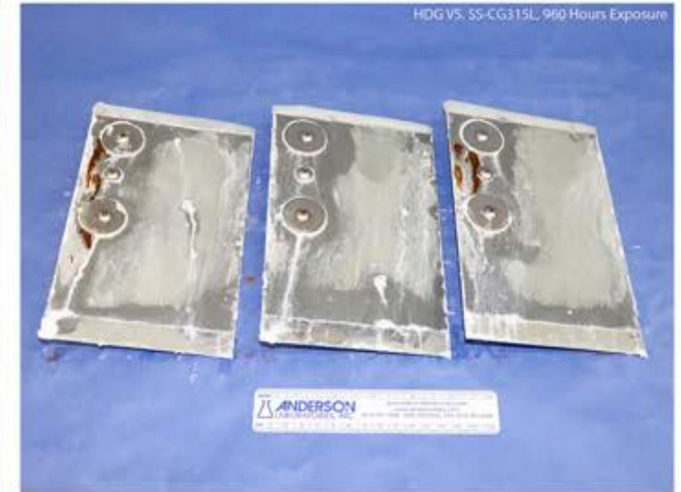
InterCoat ChemGuard 315L